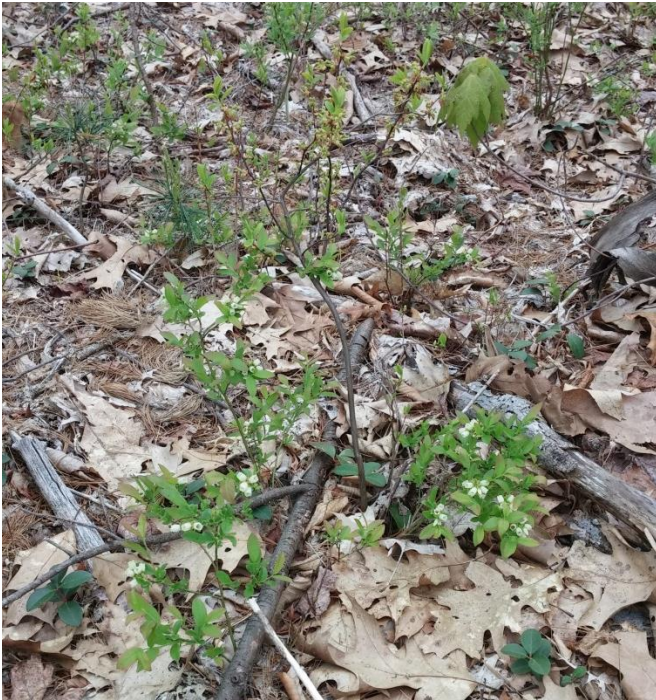
1 Regeneration after harvest including low bush blueberries, white pine, and red maple