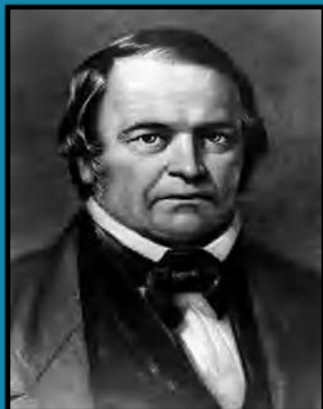
End-Times Prophet William Miller

What could a zealous 19 th century Millerite, a hermit and the owner of Worcester’s former Denholm’s department store possibly have in common? Come learn about the Worcester hilltop deeded to God and the hermit who called this place his home. Trace the history of this lofty hilltop getaway from its earliest beginnings to its final fiery demise. And what ever became of God’s Acre?