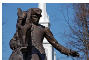
Happy Patriot's Day!

Walk around the gallery, enjoy a snack and celebrate the hidden achievements and talents of your Nashoba peers