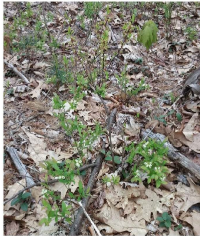
1 Regeneration after harvest including low bush blueberries, white pine, and red maple