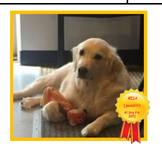
Dog licenses NOW on sale. You may license your dog online at www.ci.lancaster.ma.us